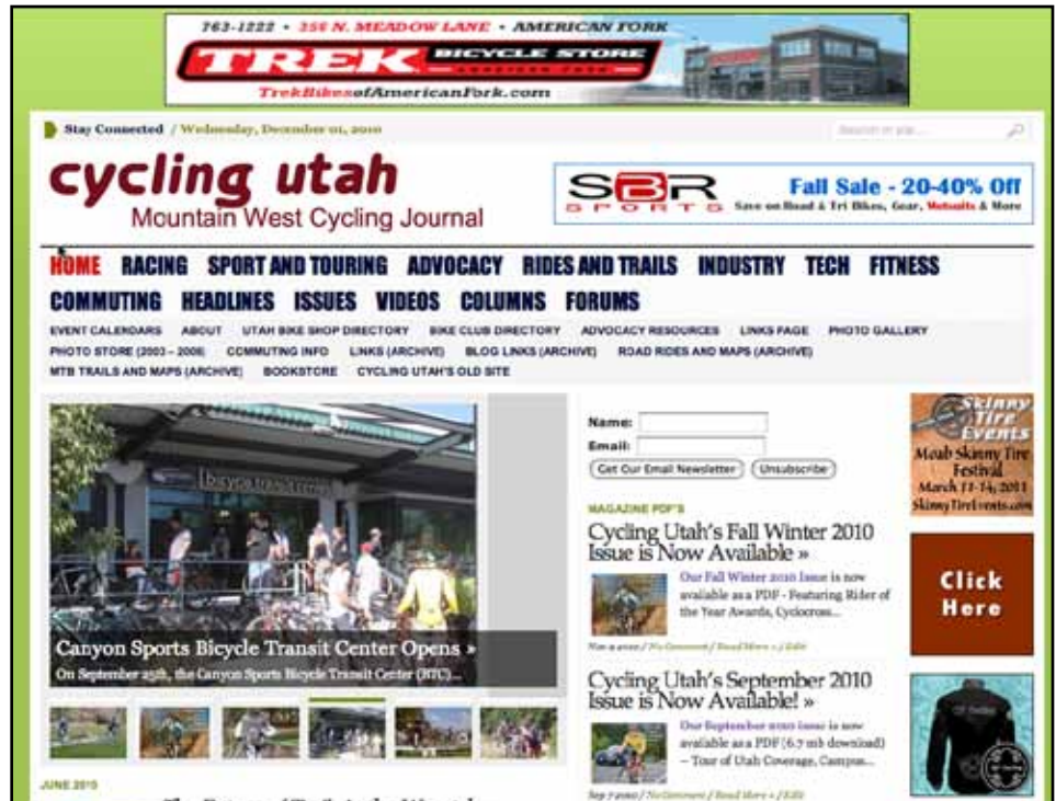
Above: cyclingutah.com homepage [Not all banner sizes shown here].

Individual page sponsorships (such as our event calendar pages) or category specific ads available on request.